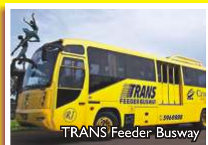
TRANS Feeder Busway