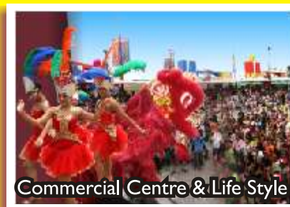
Commercial Centre & Life Style