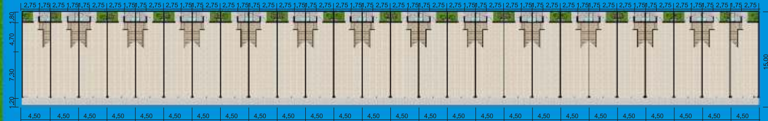
DENAH LANTAI DASAR