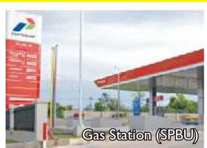
Gas Station (SPBU)